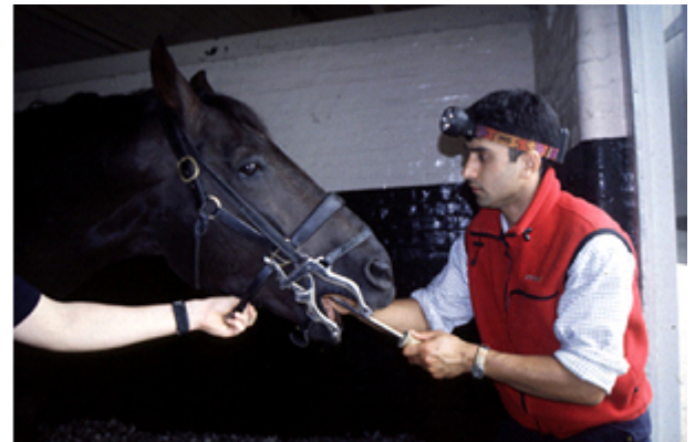
Veterinarian rasping a horse's teeth

Domestication has brought with it altered feeding patterns and many horses now spend little time grazing due to the feeding of energy dense concentrates. Not only is less time spent chewing but it has also been shown that the type of feed given to the horse can alter its chewing pattern. The same features that make the cheek teeth ideal for a life of free-range grazing (such as continual eruption and abrasive grinding surface) can produce problems in the domesticated animal. The cheek teeth of the upper jaw are set wider than those of the lower jaw and with the altered pattern of chewing, sharp points can develop on the outer edges of the upper cheek teeth and the inner edges of the lower cheek teeth. These can rub and catch against the cheeks and tongue causing ulcers.