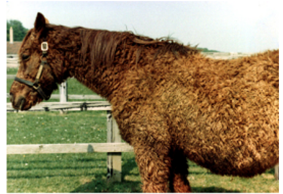
Excessively long hair coat in old horse with PPID

Pituitary pars intermedia dysfunction (PPID, previously known as Equine Cushing's Disease) is a complex condition associated with abnormal function of a small, hormone-producing organ, the pituitary gland, that lies at the base of the brain. The cause is not fully known but currently it is thought that as part of the aging process, some horses develop enlargement of part of the pituitary gland (the pars intermedia), which then produces excessive amounts of a range of hormones important in controlling the body. The hormones in question are known as the pro-opiomelanocortin-derived peptides (POMC) and include melanocystimulating hormone (MSH), corticotropin-like intermediate lobe peptide (CLIP), beta-endorphin ( \beta -END) and adrenocorticotrophic hormone (ACTH). The fact that there are several hormones involved is the reason that the name Equine Cushing's disease has been abandoned in favor of PPID since in other species Cushing's disease generally involves only one hormone system. The POMC hormones play a part in controlling a wide range of body functions and the hormonal imbalances caused in PPID result in a range of clinical abnormalities.